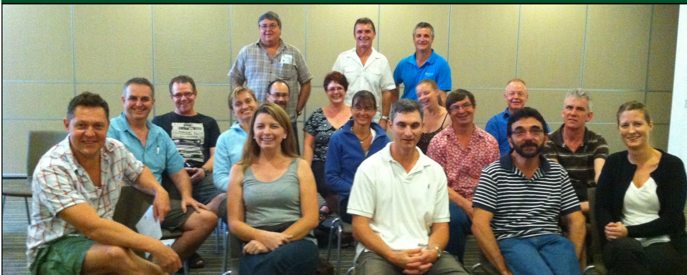
Attendees of the North Queensland Emergency Medicine Conference, Palm Cove 5th Sep 2010

This year it was Emergency Medicine Physician's from Cairns Base Hospital who hosted a very successful North Queensland Emergency Medicine Conference at Palm Cove, 4 - 5 September 2010.